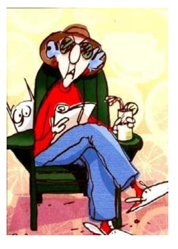
And sure enough, I felt better immediately. I never knew eating right could be so easy.