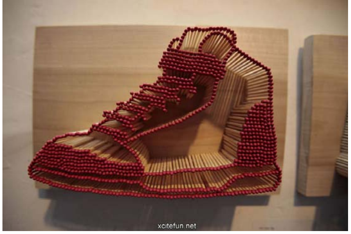
Made with matches