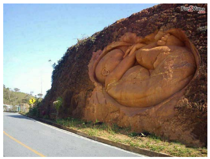
Carved in mountain